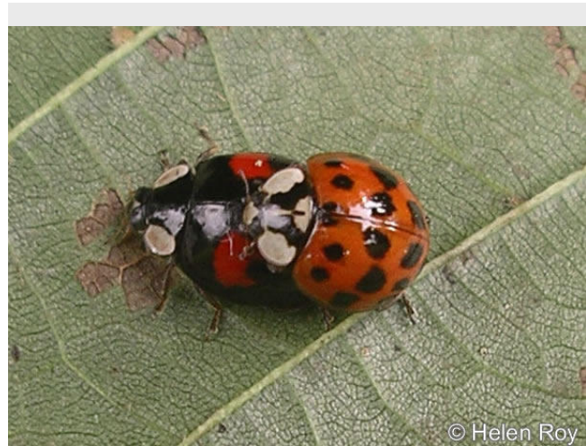
Adult of Harmonia axyridis , showing two of the colour forms found in Western Europe: succinea (orange) and conspicua (melanic)

Polyphagous predatory ladybird, 5–8 mm long, very variable in colour pattern (yellow to orange to black) with a very variable number of spots (0-21).